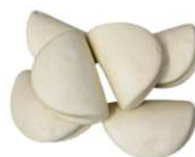
* SURGELE GUA BAO 70 G PAR 20 PIECES