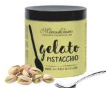
* SURGELE CREME GLACEE PISTACHE POT INDIVIDUEL 500 ML MD