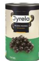
AMBIANT OLIVES NOIRES RONDELLES 5/1