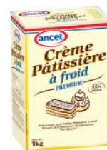
AMBIANT CREME PATISSIERE A FROID PREMIUM ANCEL 1 KG