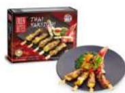
* SURGELE BROCHETTE YAKITORI 15 G PAR 67 PIECES