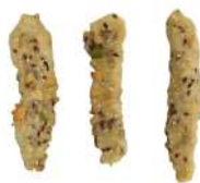
* SURGELE AIGUILLETES POULET MULTIGRAINS PANÉES 1 KG