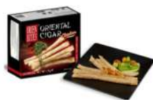
* SURGELE CIGARE AU POULET ORIENTAL 20 G PAR 50 PIECES