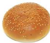
* SURGELE BUN BRIOCHE SESAME 77 GR 45P