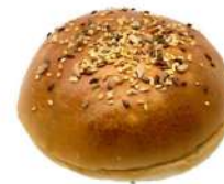
* SURGELE BUNS GOURMETS MULTIGRAINS DIAM 10.8 CM (30PAINS)