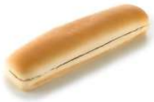
* SURGELE PAINS A HOT DOG PRE DECOUPES 20.5 CM 48P Code: 405331