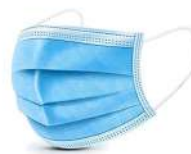
MATERIELS EMBALLAGES HYGIENE MASQUES DE PROTECTION M1/50 CERTIF CE Code: 303500