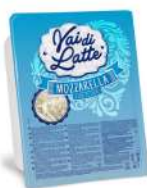
PRODUITS FRAIS FIOR DI LATTE BARQUETTE COUPE NAPOLI 2.5 KG VAI DI LATTE Code: 101163