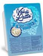
PRODUITS FRAIS FIOR DI LATTE BARQUETTE TAGLIO JULIENNE 2.5 KG VAI DI LATTE Code: 101162