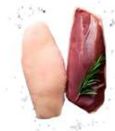
PRODUITS FRAIS MAGRET CANARD SV/1 350GR /400GR UE Code: 105115