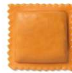
PRODUITS FRAIS QUADRONE ALLA ZUCCA 500 G FONTANETO Code: 110236