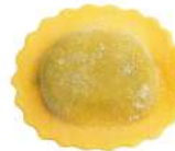
PRODUITS FRAIS DELIZIA HERBES ET PARMESAN 500 G SACHET FONTANETO