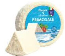
PRODUITS FRAIS PECORINO PRIMOSALE NATURALE FRAIS 1.5 KG