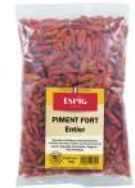
AMBIANT PIMENT FORT ENTIER OISEAU 100 GRS ESPIG Code: 204455