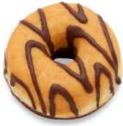
* SURGELE DONUTS FOURRES ET ENROBES CHOCOLAT (36*75 GRS)