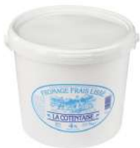
PRODUITS FRAIS FROMAGE BLANC FRAIS 20% MG 5 KGS Code: 102115