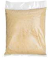
AMBIANT AMANDES BLANCHIES POUDRE 1 KG