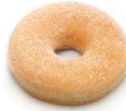
* SURGELE DONUTS SUCRES (48*65 GRS)