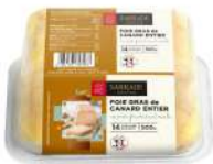
PRODUITS FRAIS FOIE GRAS CANARD ENTIER MI CUIT FRANCAIS AU POIVRE 500 G SARRADE