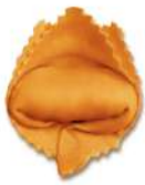
PRODUITS FRAIS TORTELLONE ALLA ZUCCA 1KG BARQ GRANCHEF