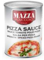
AMBIANT SAUCE PIZZA AROMATISEE 5/1 MAZZA Code: 201132