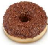
* SURGELE DONUTS ENROBES CHOCOLAT (36*55 GRS)