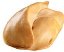
PRODUITS FRAIS FOIE GRAS CANARD CRU IER CHOIX DEVEINE FRANCAIS SARRADE