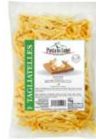
PRODUITS FRAIS TAGLIATELLES FRAICHES AUX OEUFS FRAIS 1 KG PASTA DI LUIGI