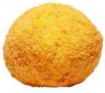
* SURGELE ARANCINI ALLA CAPRESE 220 GRS * 24 SEMPRE GHIOTTI