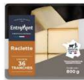
PRODUITS FRAIS RACLETTE TRANCHE 800 GR (36 TRANCHES) Code: 101416