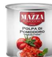
AMBIANT TOMATES ITALIENNES CONCASSEES EN CUBE 3/1 MAZZA Code: 201130