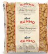
AMBIANT MEZZI RIGATONI N°51 3 KGS RUMMO