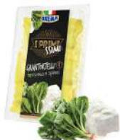
PRODUITS FRAIS GRANTORTELLI RICOTTA EPINARDS BARQUETTE DE 250 GRAMMES Code: 110105