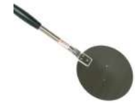
MATERIELS EMBALLAGES HYGIENE PELLE A CUIRE DIAM 20 LONGUEUR 150 CMS