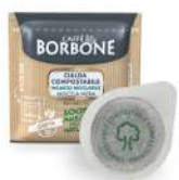
AMBIANT CAFE BLACK PODS X 150 BORBONE Code: 209462