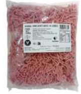
* SURGELE EGRENE PUR BŒUF (20% MG) 1KG UE GRANCOEUR