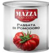
AMBIANT PASSATA – PUREE DE TOMATES ITALIENNES 3/1 MAZZA