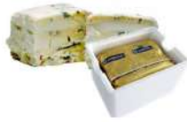
PRODUITS FRAIS GORGONZOLA MASCARPONE DOP 1.2 KG AMBROSI